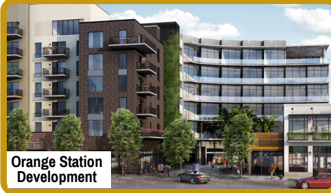
Orange Station Development