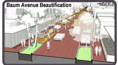
Baum Avenue Beautification