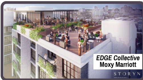
EDGE Collective Moxy Marriott